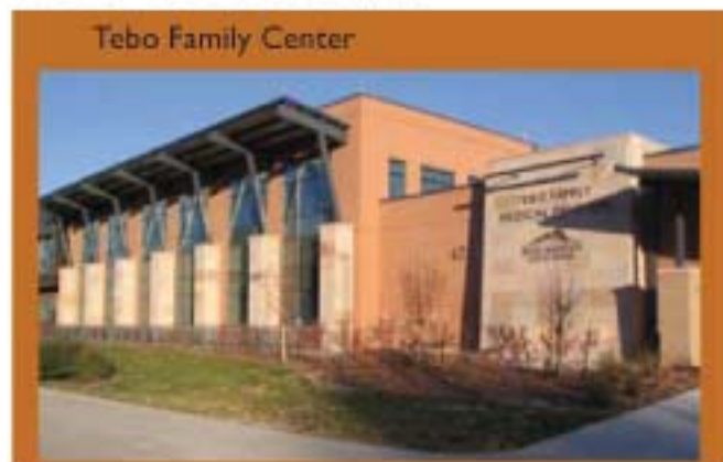
Tebo Family Center